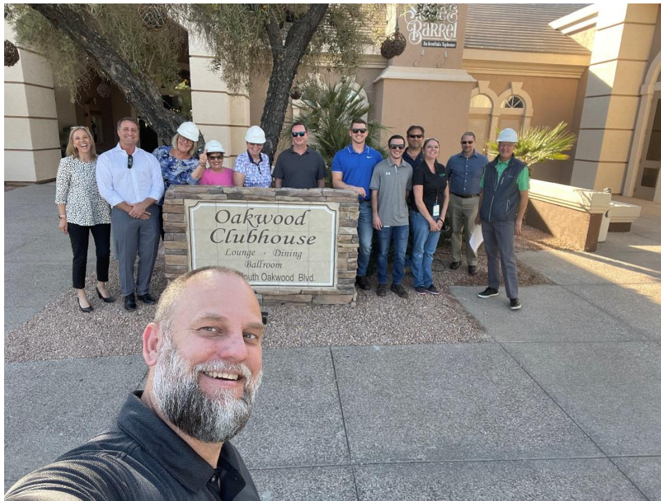
Cox team along with members of the Sun Lakes- IronOaks Homeowners Association.